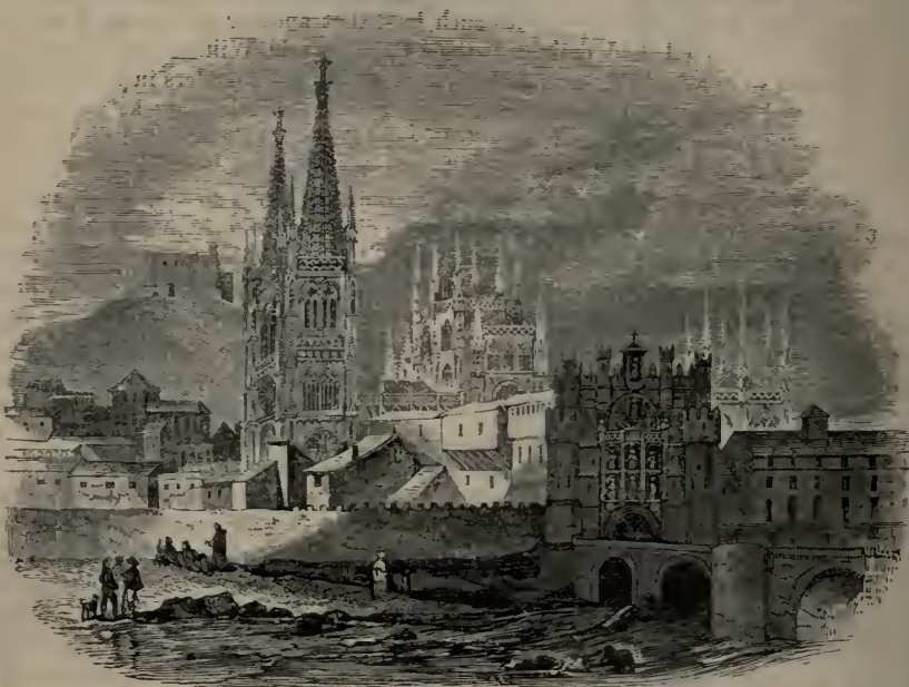
CITY OF BURGOS.—From La Borde's Voyage Pittoresque en Espagne .

barons and knights of France: it was magnificently grand, according to the custom in Spain. On the morrow, before noon, all the men at arms were sent off to their different garrisons, with instructions from their leaders how to act. Sir Oliver du Guesclin, count de Longueville, was ordered, with a thousand spears, to a tolerably strong town on the borders of Galicia, called Ville-sainte*; sir Reginald and sir Tristan de Rove to another town, ten leagues further, but on the frontier of Galicia, called Ville-d'Agillare-de-Champ†, with three hundred lances; sir Peter de Belesme, with two hundred lances, to Beneventé; the count de Lerma to the town of Zamora; sir John des Barres, with three hundred, to the castle of Noya; sir John de Châtelmorant and sir Tristan de la Jaille, with others, to the city of Valencia; the viscount de Besliere to the town of Ribesda, with sir John and sir Robert de Braquemont. In such manner were the men at arms divided: sir Oliver du Guesclin was nominated constable, having the largest body under his command; and sir William de Lignac and sir Walter de Passac remained near the king at Burgos, and attended him wherever he went.